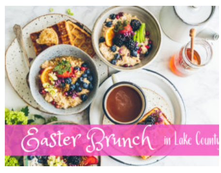
Easter Brunch in Lake County