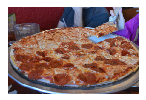
Little Reviews: Hitz Sports Bar {Mundelein}