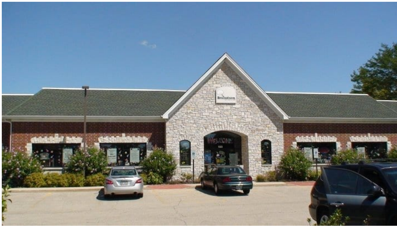
Brainstorm, Inc. - Lindenhurst

Holiday pageants are over, decorations are packed away, and chilly weather lends itself to cozy pajama days in the homeschool classroom. But parents and students alike may find themselves eventually looking for an excuse to get out of the house. Lake County (and it's surrounding communities) offer an abundance of opportunities for education outside the classroom.