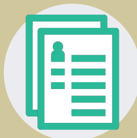
Conversation Cheat Sheet + Convert the Conversation

All roads lead to a 1:1 conversation with you. The people who land here already like & trust you, and want to learn more from you!