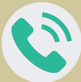
1:1 Call or Meeting