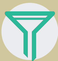
Lead Magnet Funnel