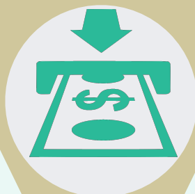
Enroll your new member

This is where your business grows and duplicates. Every action you perform in your business is in service of maximizing visibility & curiosity, connecting with the most curious regularly and enrolling them as members.... so they can access your resources, then duplicate the same actions to grow with you on your team.