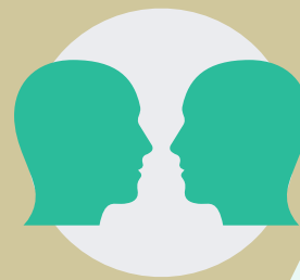
Warm Market + Referrals