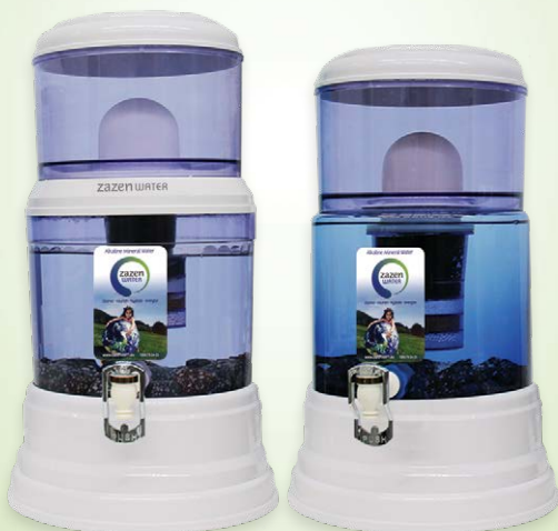
BPA Free System